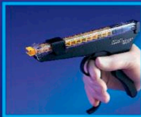
ACRAGUN Comfortable and easy to use